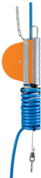
Type 7221 / 7222